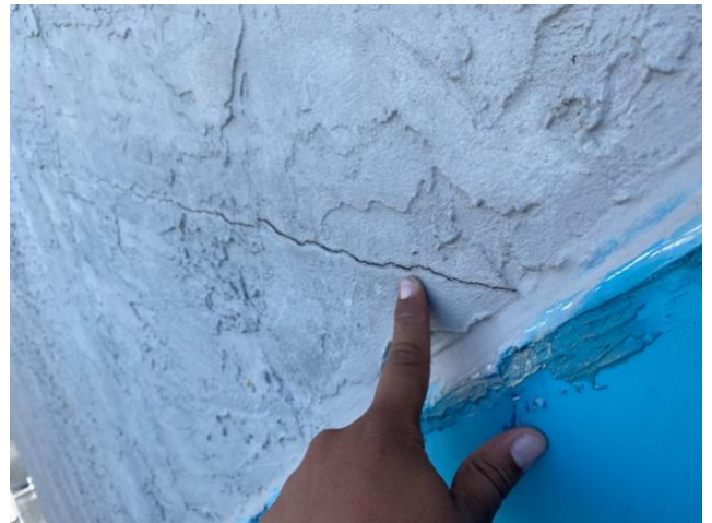
East area. Stucco appears to have been patched prior and the patch is delaminating. Crack also runs from one end of the repair to the next.