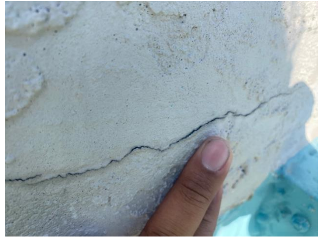
West area. Cracking forming along the stucco and delaminating.