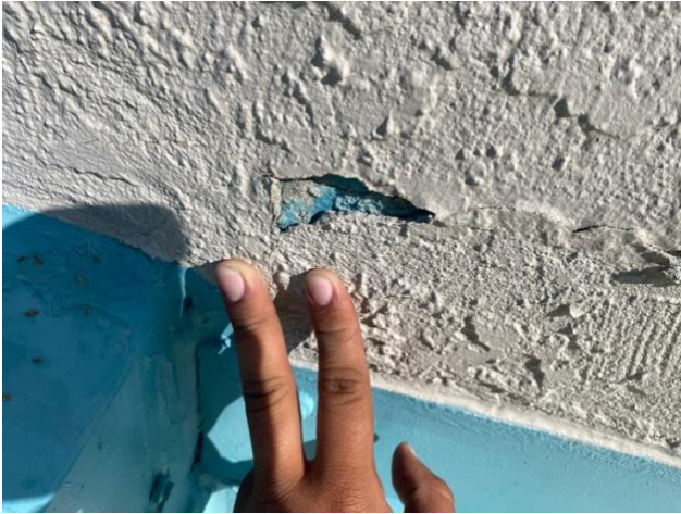
West area. Stucco breaking and delaminating.