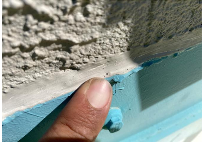
East area. Multiple voids observed in the sealants above flashing.