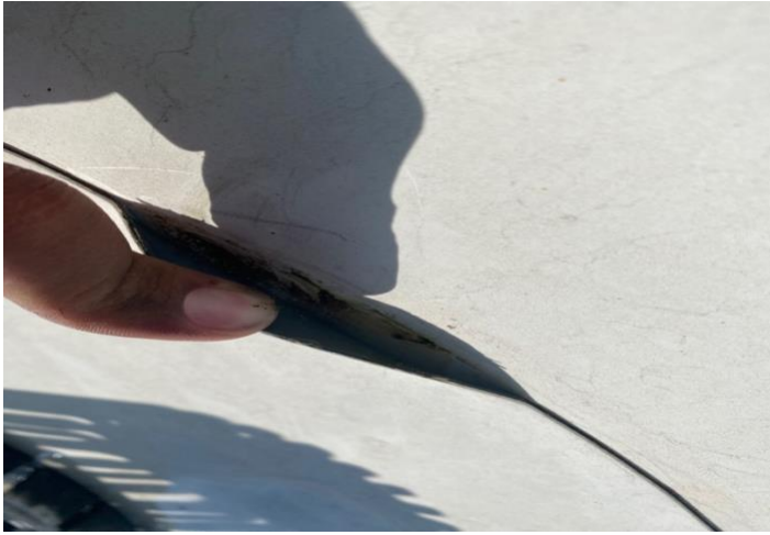
East area. TPO roof is peeling around the drain the drain.